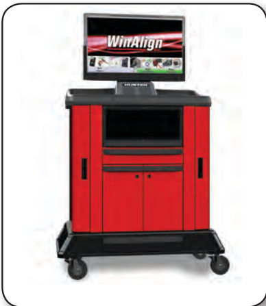
For combination light/heavy duty systems only